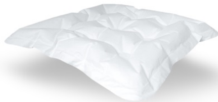
all up® seat