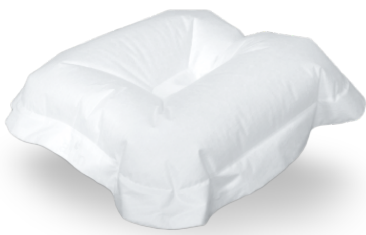
all up® head

all up® products are user-specific & disposable with an ergonomic design that provides good stability. The external layer is made of soft, flexible, heat & moisture absorbent non-woven material, which makes the all up® comfortable to use.