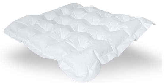
all up® universal long (also shown below)